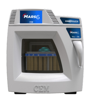
Figure 2. MARS 6 with iWave Temperature Sensor

Samples run for trace elements on Agilent ICP-MS 7900 using Meinhard nebulizer with cyclonic spray chamber using the lines reported in Table 1. Supplemental helium gas was used to improve the response of Arsenic and Chromium.