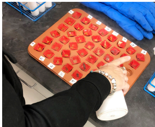
Figure 1. Sample Preparation of Bread Spreads

Bread spreads were frozen using liquid nitrogen by applying a known amount of sample to a silicone non-stick mold and pouring liquid nitrogen over the sample multiple times in order to flash freeze the sample, Figure 1. This was done to ensure that all of the sample reached the bottom of the digestion vessel, a task which is difficult when bread spreads are at room temperature.